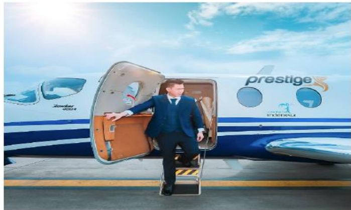
19 (Source: Instagram 20 ( https://www.instagram.com/p/CjtKGWlpQ4I/ ))

5 62. Hindenburg highlighted that one photo posted on Instagram (by an 6 unknown person who may have been affiliated with Prestige) of a Prestige-branded 7 jet appeared to be identical to a jet (except that it did not have the Prestige logo) 8 featured in another Instagram post by the same user, in the same week as the post 9 with the plane with the Prestige logo, leading Hindenburg to believe the Prestige 10 logo was photoshopped onto the plane. Below is the photo of the aircraft with the 11 logo that Hindenburg claimed was photoshopped onto the plane: