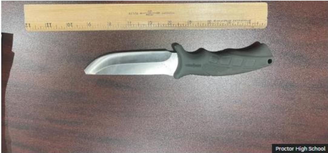
Knife used in stabbing

88. The May 23 BBC Article further stated: